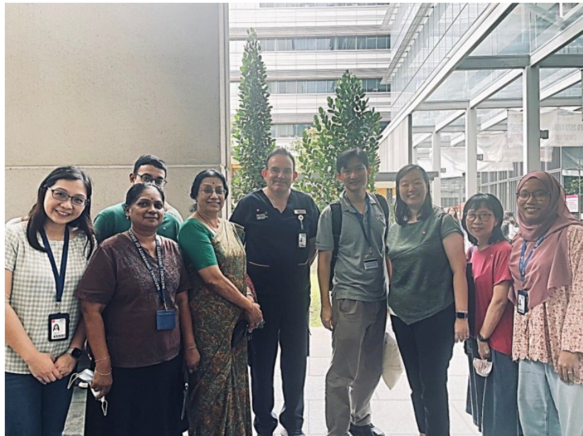
Dept staff and students at the lunch reception