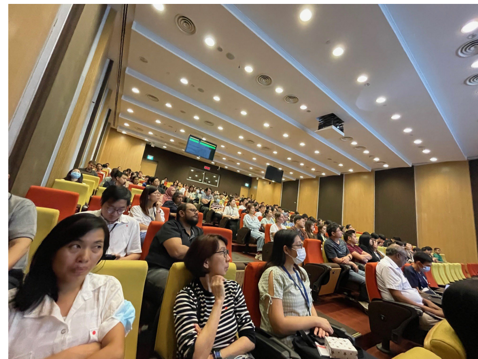
Participants at the safety talk.