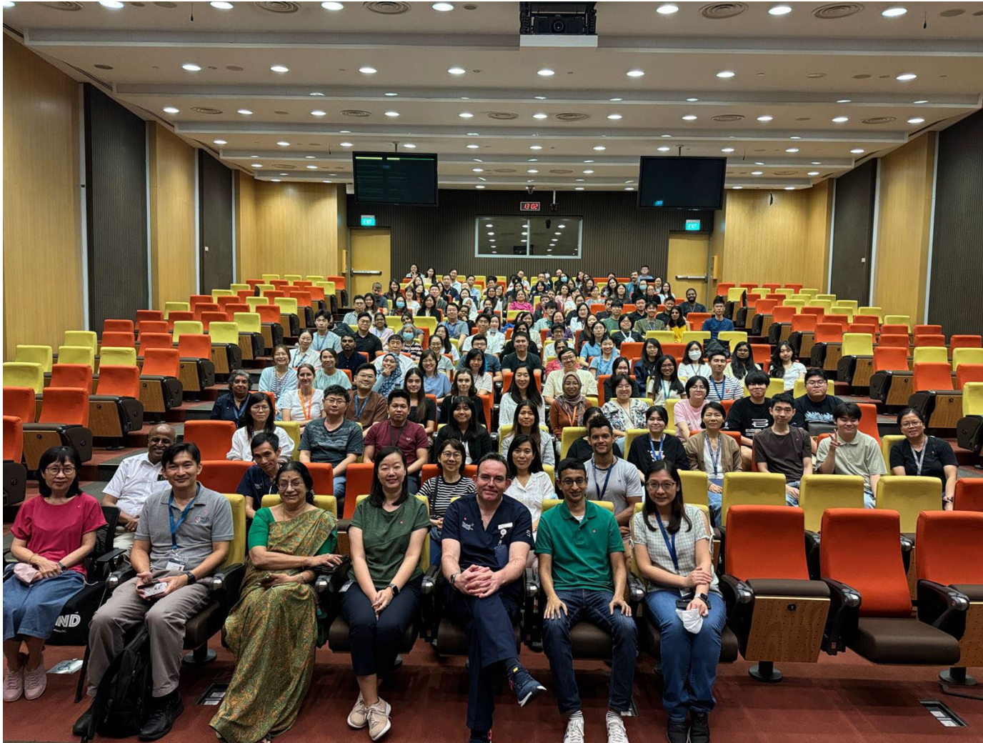
Dept of Medicine Safety Committee, Pls, staff and students attending the talk.

Topic: Good Practices in Managing Hazardous Materials in Lab